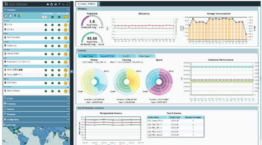
The Portfolio Dashboard delivers a comprehensive set of metrics for a convenient single pane of glass view into the efficiency, capacity and performance status of the entire infrastructure.

As traditional servers transition onto blade servers an average consolidation ratio of 9 to 1 is achieved. At an average workload, a traditional server consumes 500 Watts of power versus about 2500 Watts per blade server. This means a 45% reduction in direct energy costs for the same amount of processing while increasing fault tolerance and performance through load balancing. With a typical PUE of 2.0, costs associated with cooling and other infrastructure support are also roughly halved. 1,243 traditional servers were consolidated onto 137 Blade servers. The resultant reduction in energy costs was over $500,000. Based on drawing power from a coal-fired base-load power plant, the reduction in carbon emissions from this project equates to 2,841 tons. The consolidation would not have been possible without Nlyte Energy Optimizer to constantly monitor the load.