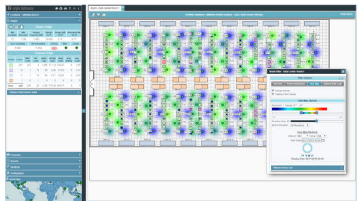
The Heat Map provides a graphical look at temperatures throughout the data center.

The solution is an open platform, able to speak a variety of languages and protocols, enabling clients to free up data that might otherwise be siloed and inaccessible. The real-time energy reports allow consolidation without overload.